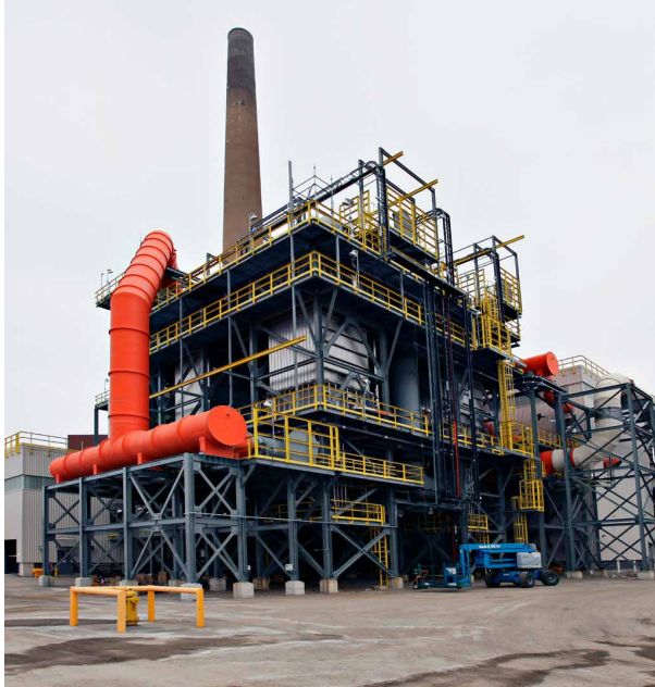
The Converter Wet Gas Cleaning plant now captures 85% of the SO 2 emissions previously emitted by the Superstack.