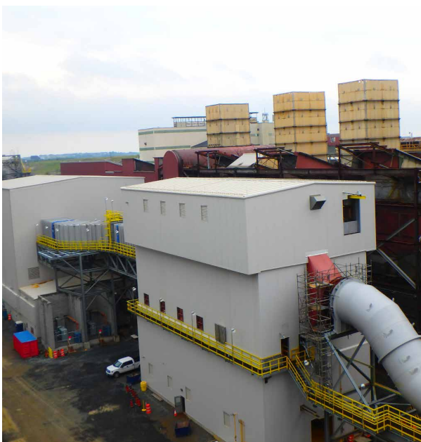
This new Baghouse and Fan Building acts like a giant vacuum cleaner and will reduce metals particulate emissions by 40%