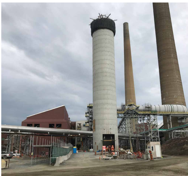
The two new 137 metre (450 feet) stacks will be more efficient to operate than the Superstack. Natural gas consumption at the Smelter is expected to drop by nearly half once the Superstack is no longer in service.