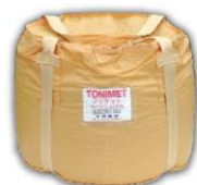
1 or 2 tonne bag

Disclaimer: The product descriptions and specifications contained in this document are made in accordance with our analyses and the methods used to produce Vale's nickel products. While these descriptions and specifications are reflective of normal production lots, rather than each individual piece, such descriptions and specifications shall in no event be deemed or interpreted as any representation, warranty or commitment by Vale in connection with Vale's nickel products quality. Vale's nickel products quality shall be determined only in accordance with the corresponding contract terms for each transaction agreed between Vale and Vale's customer and the quality related certificate issued under such contract.