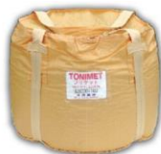
1 or 2 tonne bag

Disclaimer: The product descriptions and specifications contained in this document are made in accordance with our analyses and the methods used to produce Vale's nickel products. While these descriptions and specifications are reflective of normal production lots, rather than each individual piece, such descriptions and specifications shall in no event be deemed or interpreted as any representation, warranty or commitment by Vale in connection with Vale's nickel products quality. Vale's nickel products quality shall be determined only in accordance with the corresponding contract terms for each transaction agreed between Vale and Vale's customer and the quality related certificate issued under such contract.