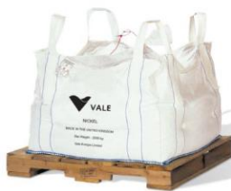
2 tonne bag

Disclaimer: The product descriptions and specifications contained in this document are made in accordance with our analyses and the methods used to produce Vale's nickel products. While these descriptions and specifications are reflective of normal production lots, rather than each individual piece, such descriptions and specifications shall in no event be deemed or interpreted as any representation, warranty or commitment by Vale in connection with Vale's nickel products quality. Vale's nickel products quality shall be determined only in accordance with the corresponding contract terms for each transaction agreed between Vale and Vale's customer and the quality related certificate issued under such contract.