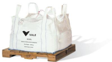
2 tonne bag

Disclaimer: The product descriptions and specifications contained in this document are made in accordance with our analyses and the methods used to produce Vale's nickel products. While these descriptions and specifications are reflective of normal production lots, rather than each individual piece, such descriptions and specifications shall in no event be deemed or interpreted as any representation, warranty or commitment by Vale in connection with Vale's nickel products quality. Vale's nickel products quality shall be determined only in accordance with the corresponding contract terms for each transaction agreed between Vale and Vale's customer and the quality related certificate issued under such contract.