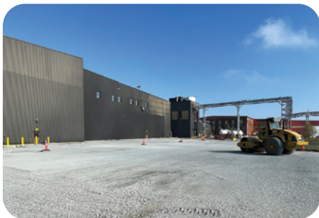
New bleach storage facility under construction