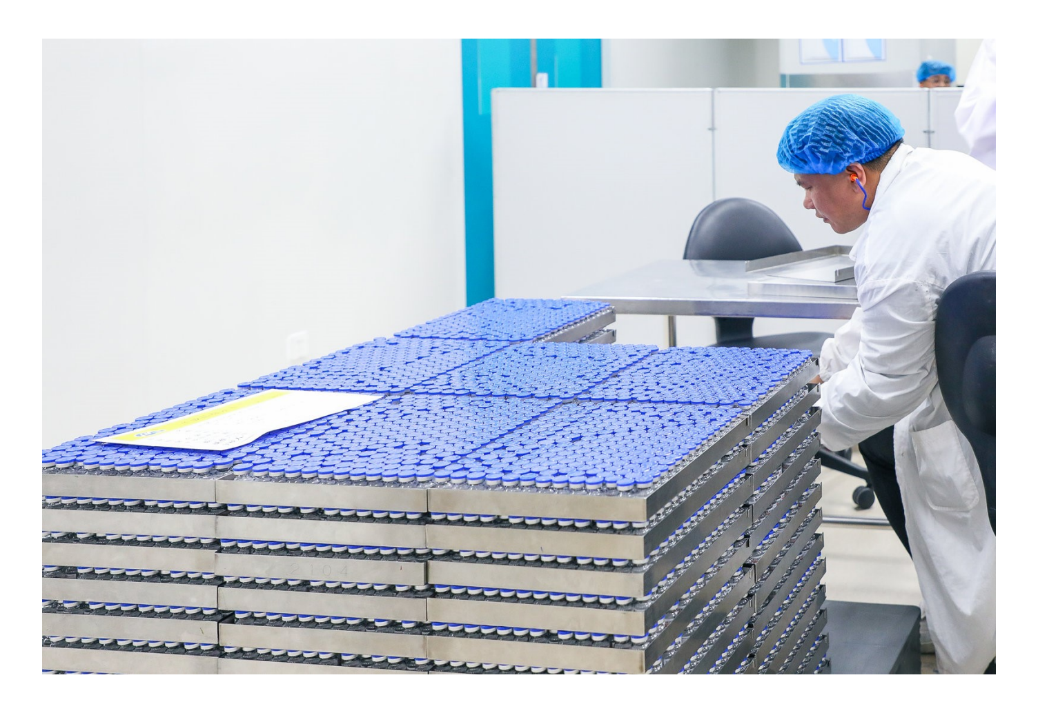
Manufacturing of intubation medicines in Lianyungang, China