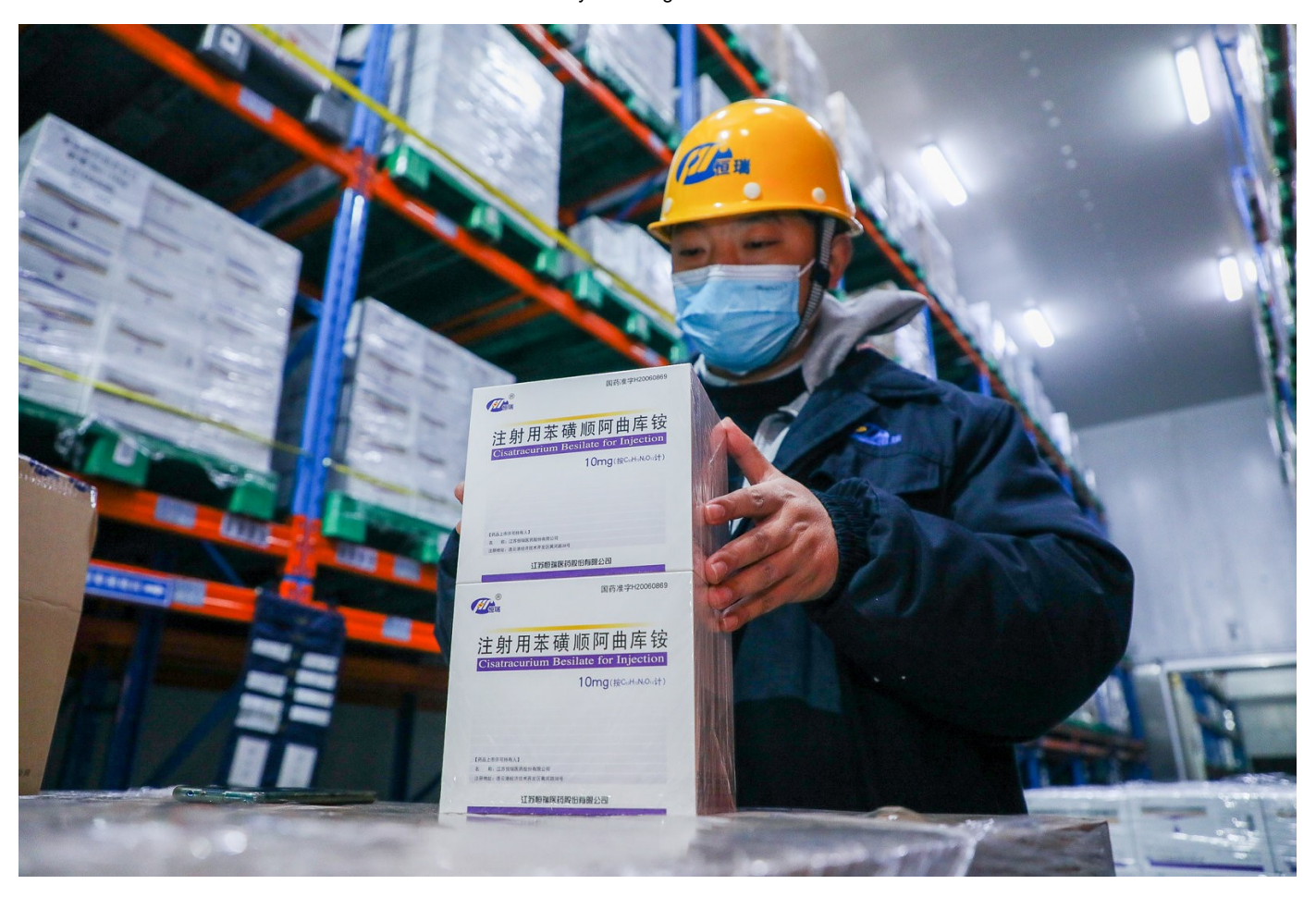
Manufacturing of intubation medicines in Lianyungang, China