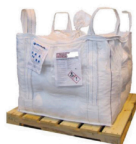
2 tonne bag

Disclaimer: The product descriptions and specifications contained in this document are made in accordance with our analyses and the methods used to produce Vale's nickel products. While these descriptions and specifications are reflective of normal production lots, rather than each individual piece, such descriptions and specifications shall in no event be deemed or interpreted as any representation, warranty or commitment by Vale in connection with Vale's nickel products quality. Vale's nickel products quality shall be determined only in accordance with the corresponding contract terms for each transaction agreed between Vale and Vale's customer and the quality related certificate issued under such contract.